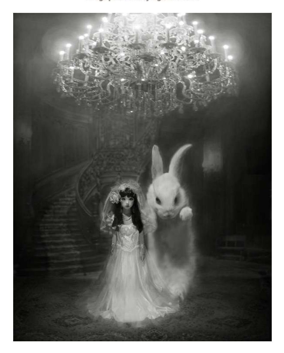
Zhang Peng | Made in China no.9 | 2012 | C-Print | 225×182 cm