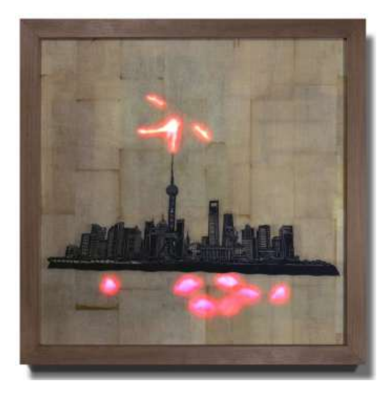
Island 6 | Nezha Ascends The Pearl | 2012 | LED display, Chinese papercut (Jian Zhi 剪紙), paper collage, teakwood frame | 103 x 103 x 9 cm