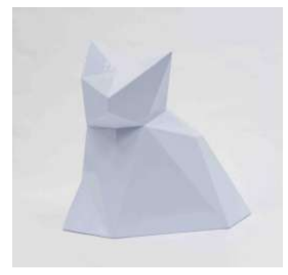
David Chan \mid Molly \mid Fibreglass and Resin, Steel cover with powder coating \mid 2012 \mid 60 x 40 x 35cm