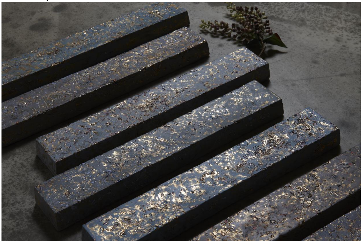
cera-stone_wall deco vase