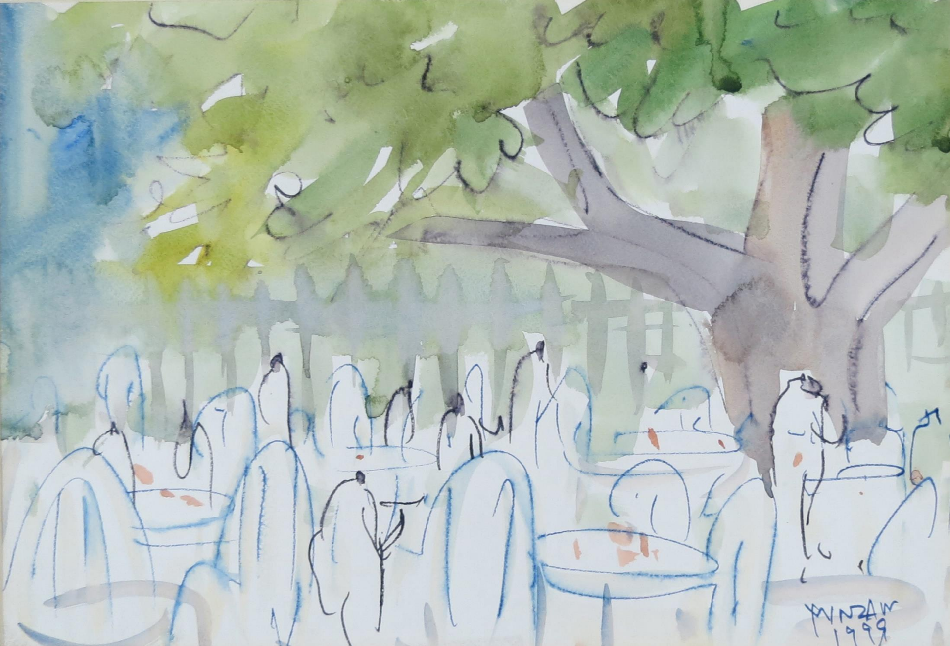
Min Zaw, Thuang Tha Man Lake, 1999, Water Color, 28 x 38 cm