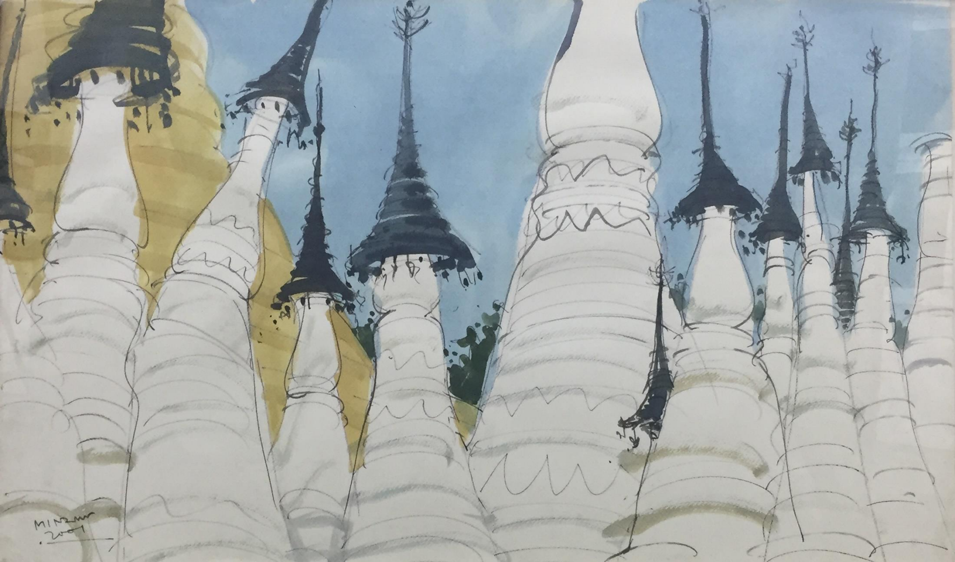
Min Zaw, Untitled, 2001, Water Color, 46 x 76 cm