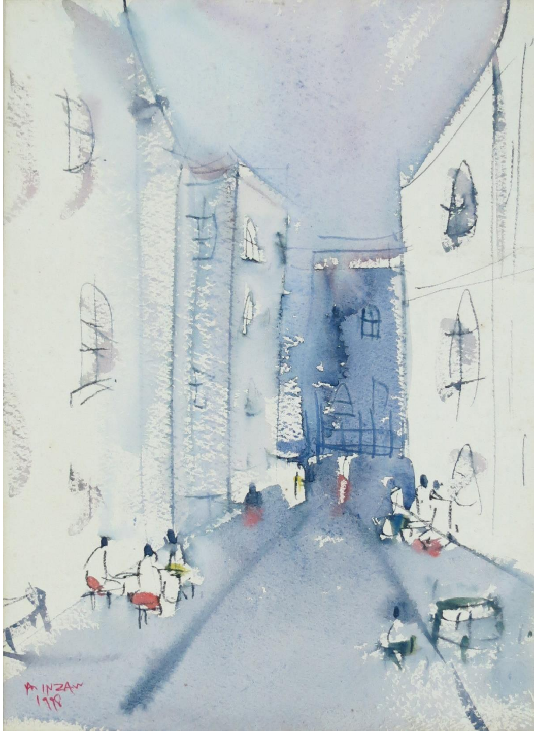
Min Zaw Tea Shop 1998 Water Color 38 x 28 cm