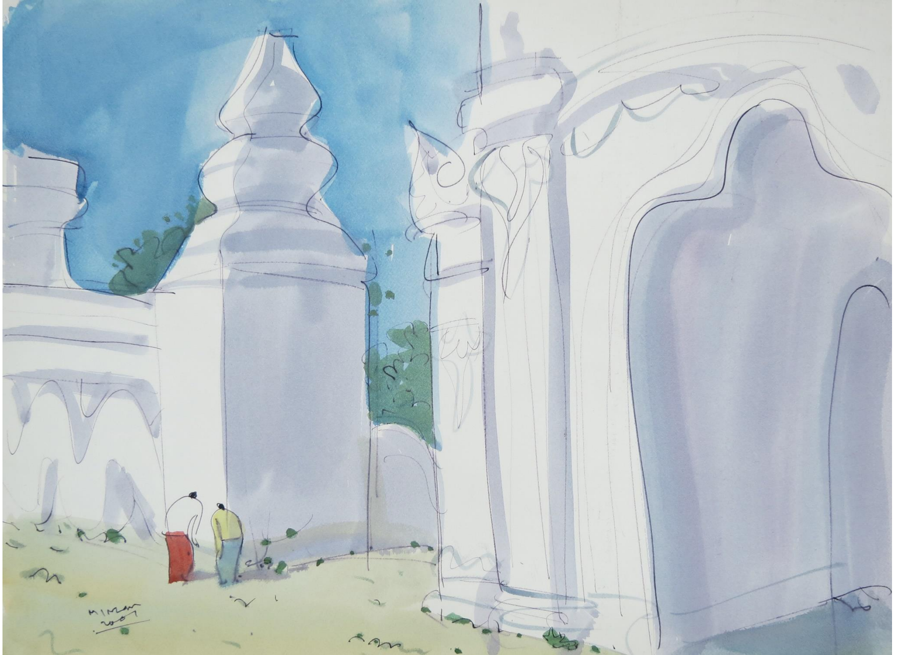
Min Zaw, Untitled, 2001, Water Color, 56 x 76 cm