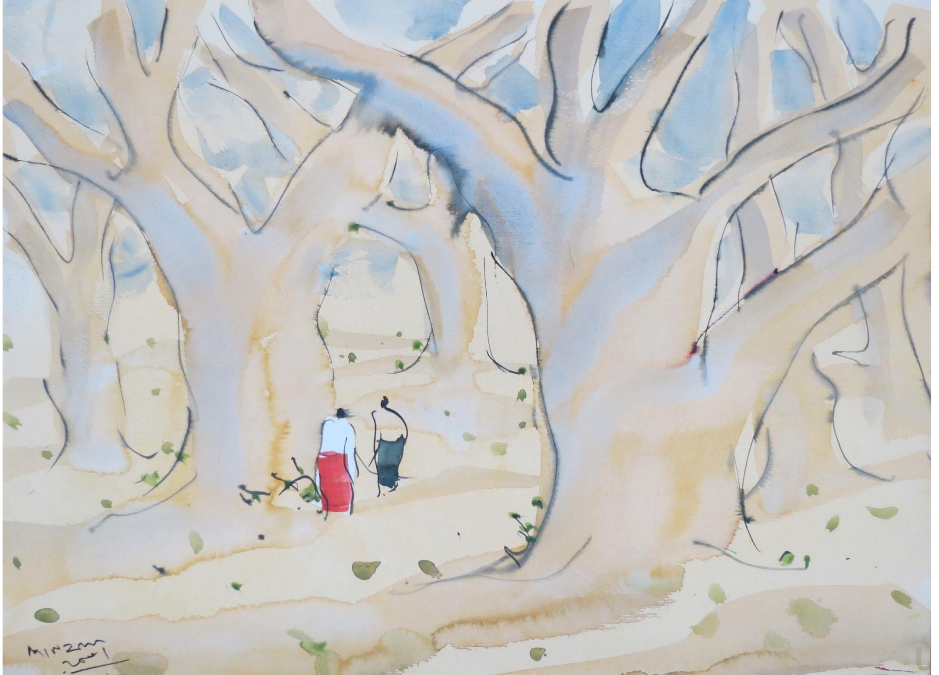
Min Zaw, Untitled, 2001, Water Color, 39 x 53 cm