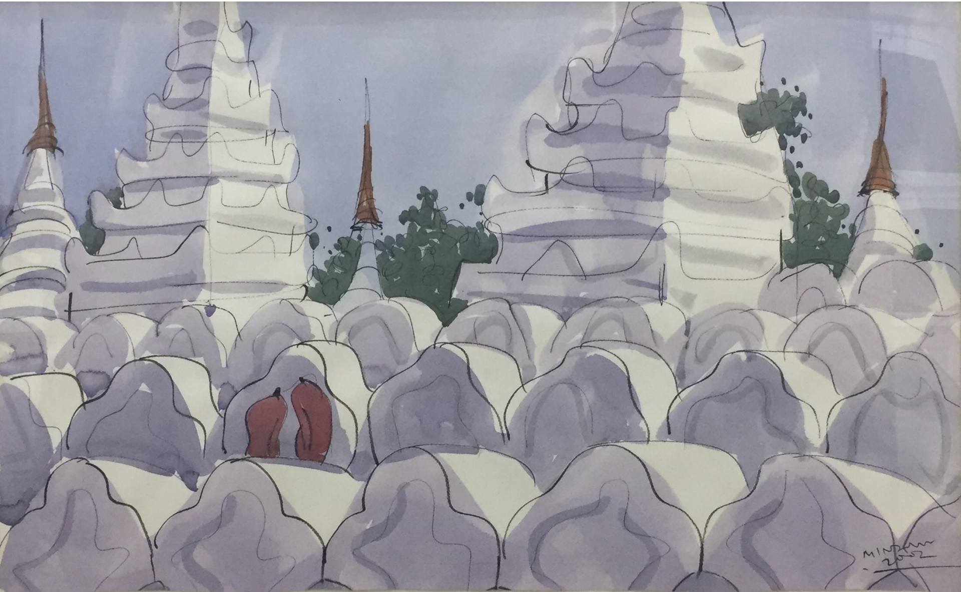
Min Zaw, Sandamuni Pagoda Platform, 2002, Water Color, 47 x 76 cm