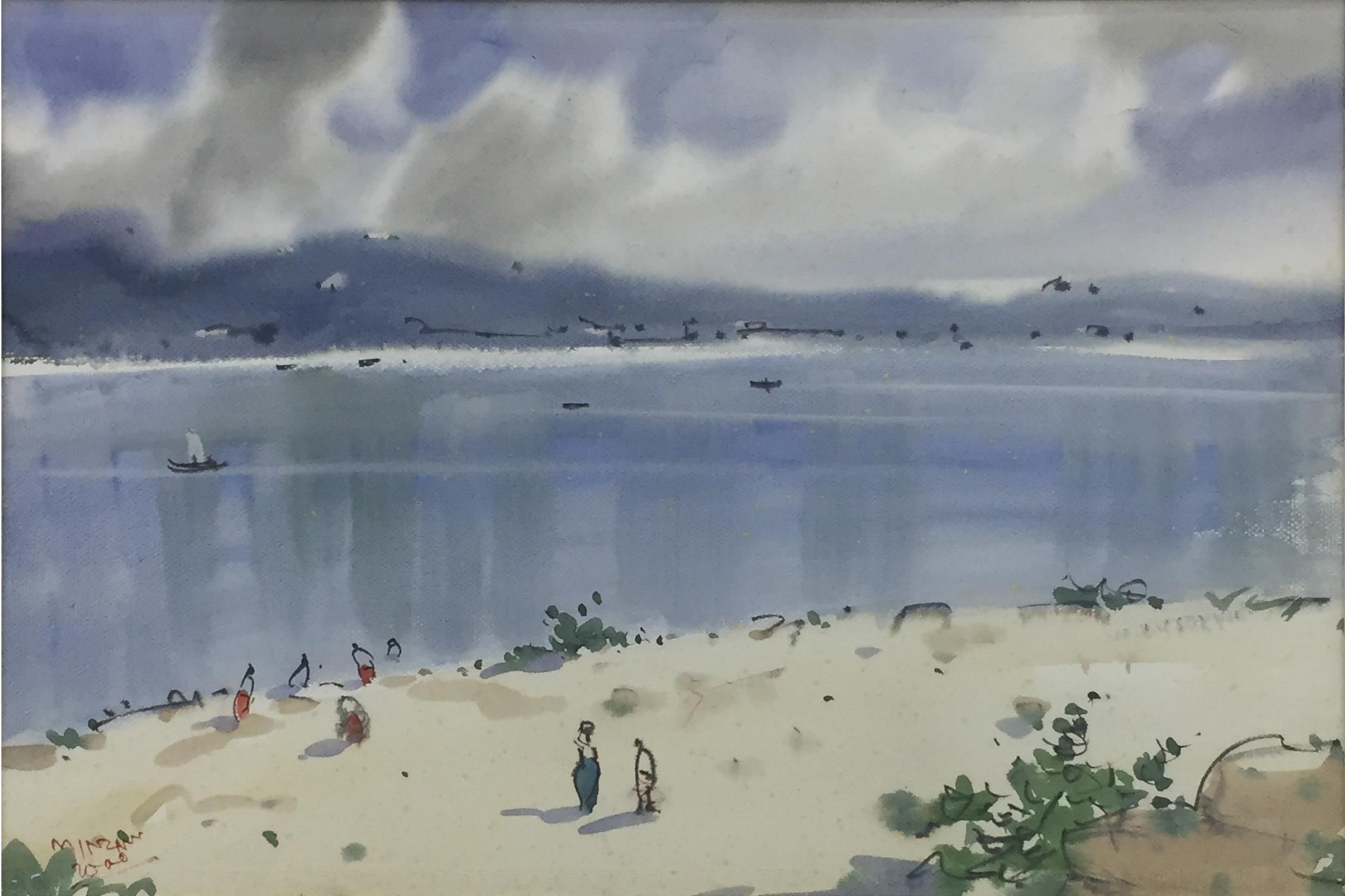
Min Zaw, Bagan Series, 2000, Water Color, 38 x 56 cm