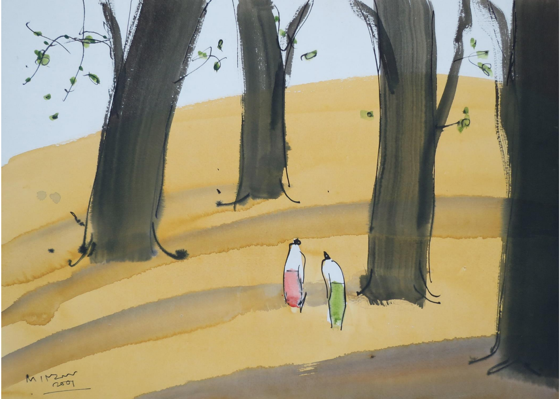
Min Zaw, Trees, 2001, Water Color, 39 x 53 cm