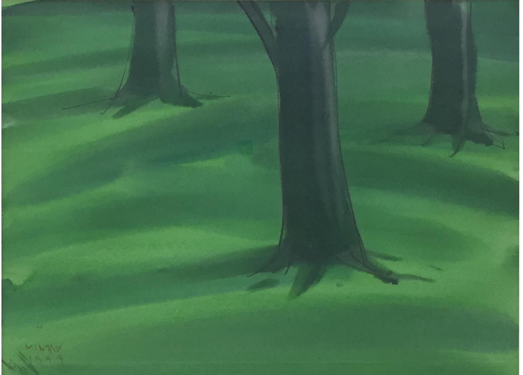
Min Zaw, Landscape Series, 1999, Water Color, 28 x 38 cm