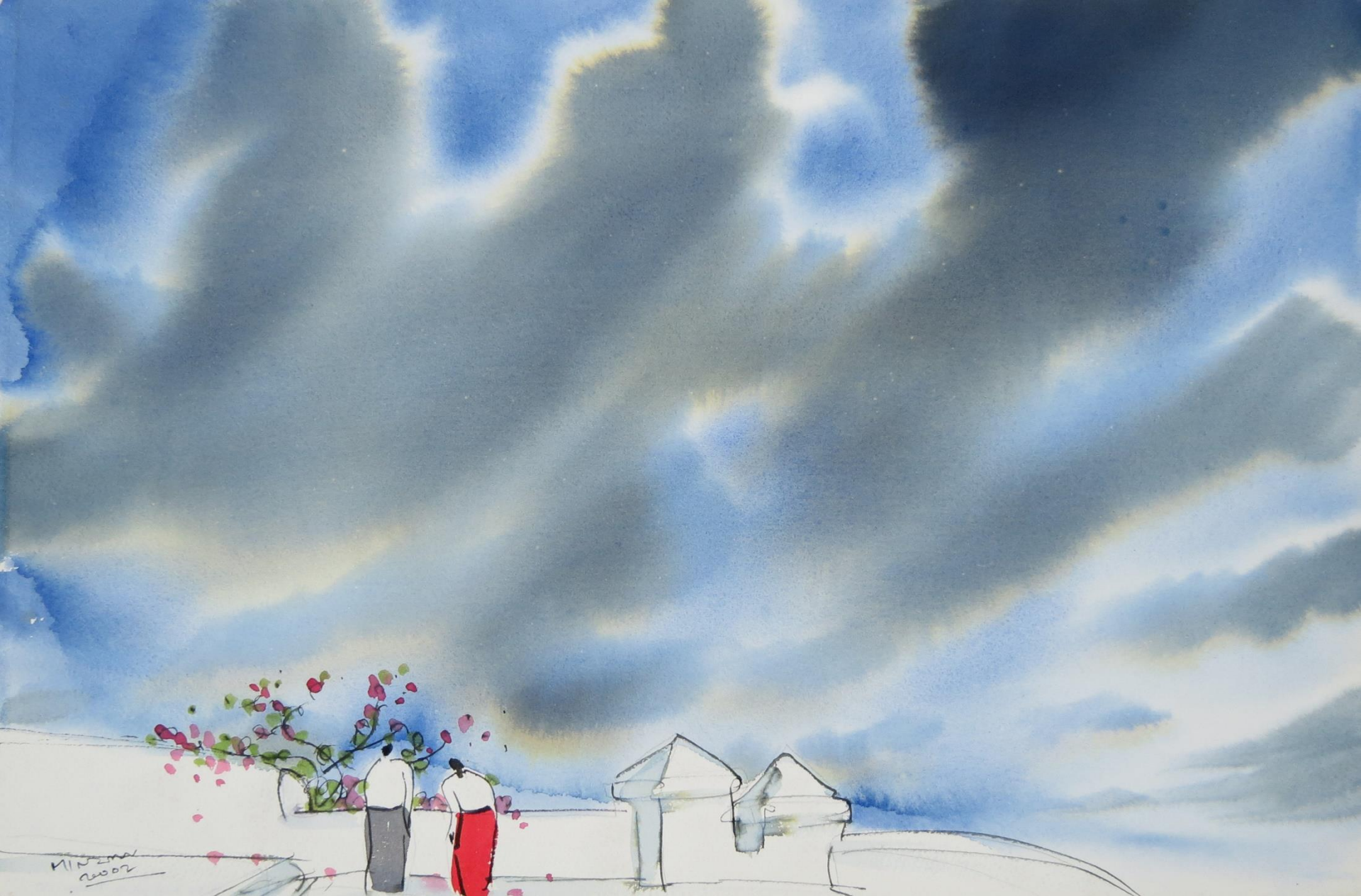
Min Zaw, Two Men at Shwe Kyet Kya Platform II, 2002, Water Color, 37 x 55 cm