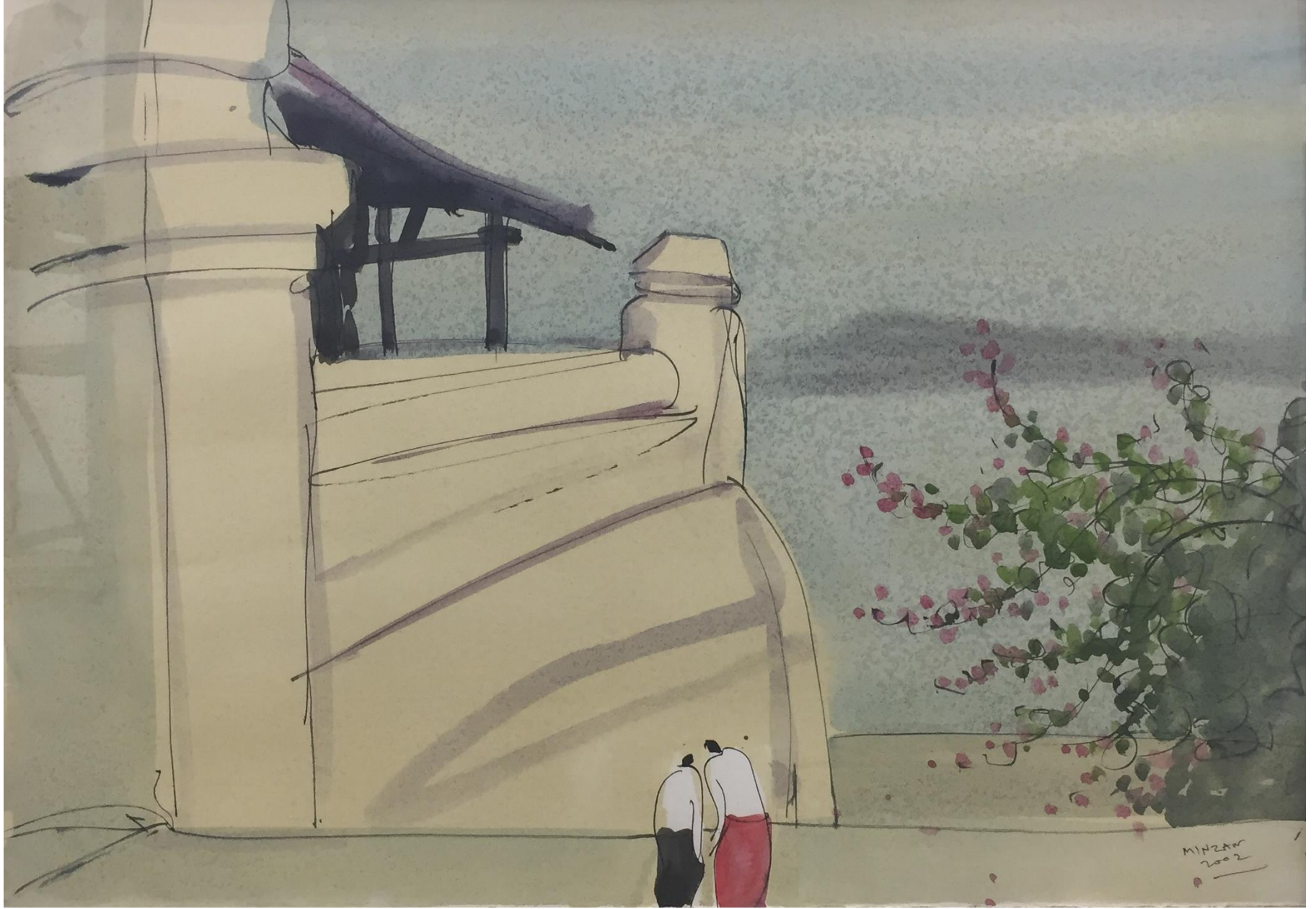
Min Zaw, The Men on Shwekyetyet Morning II, 2002, Water Color, 55 x 79 cm