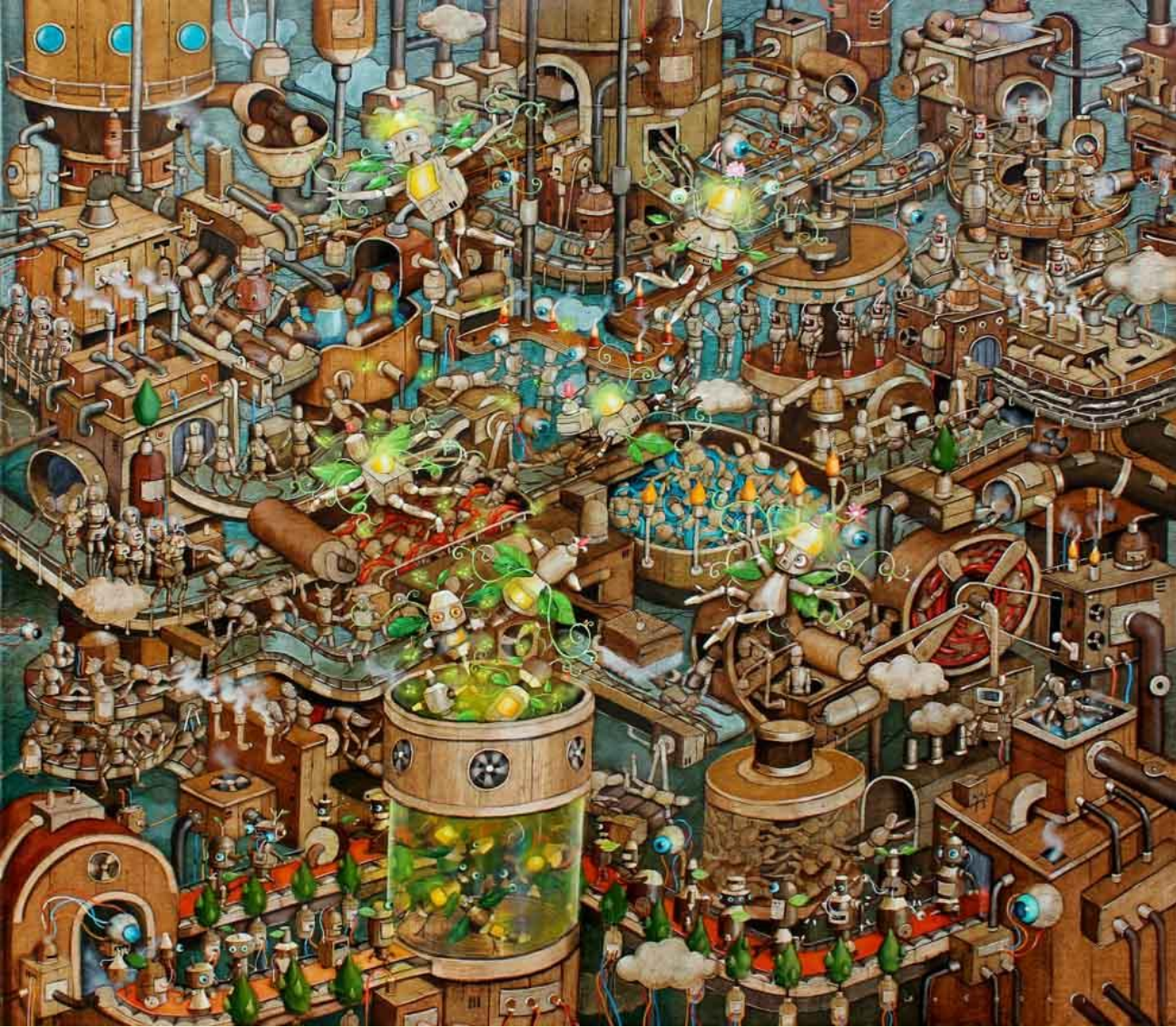
Gatot Indrajati | CONVEYORISM | 2012 | Acrylic on canvas | 200 x 185 cm