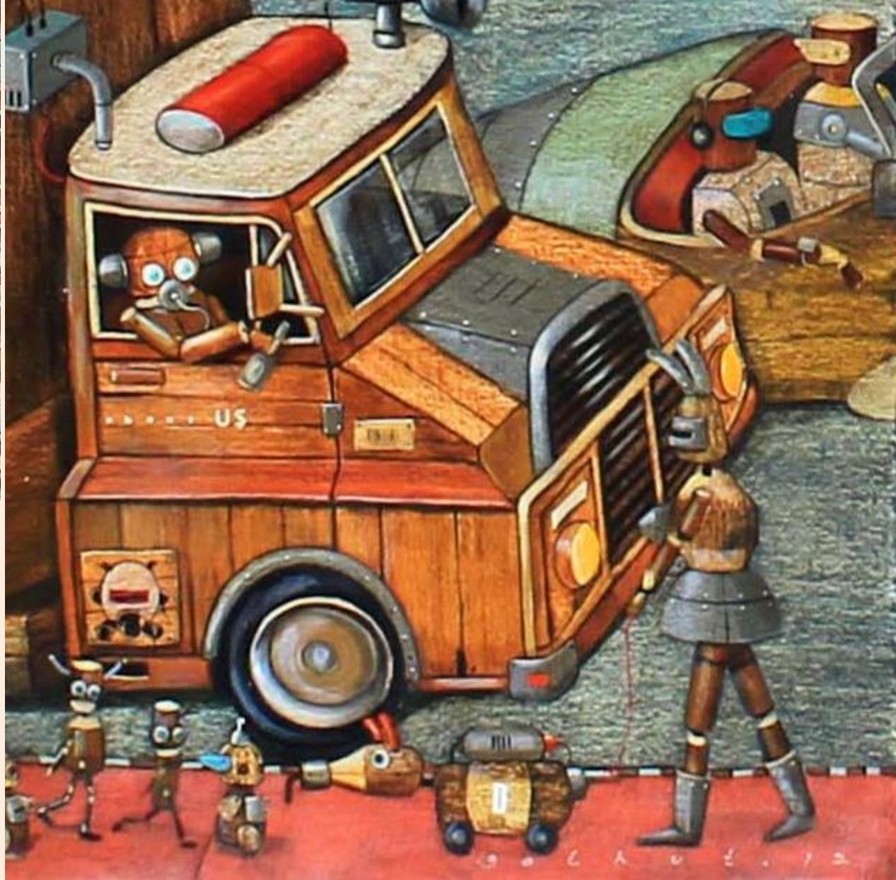
Gatot Indrajati | CULTURE SHOCK | 2012 | Acrylic on canvas | 125 x 400cm (2 Panel) (Details)