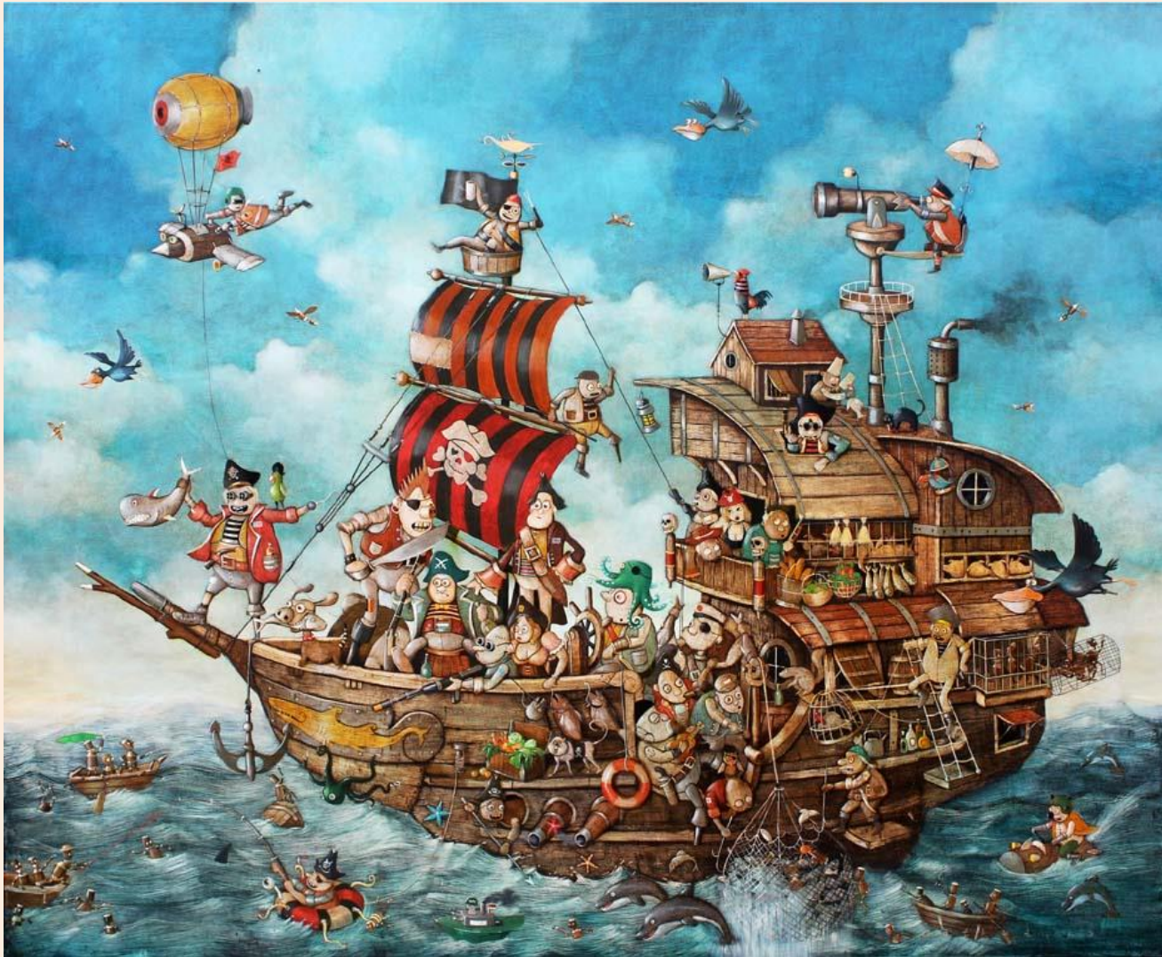
Gatot Indrajati | FISHERMAN FRIEND | 2013 | Acrylic on canvas | 190 x 225cm