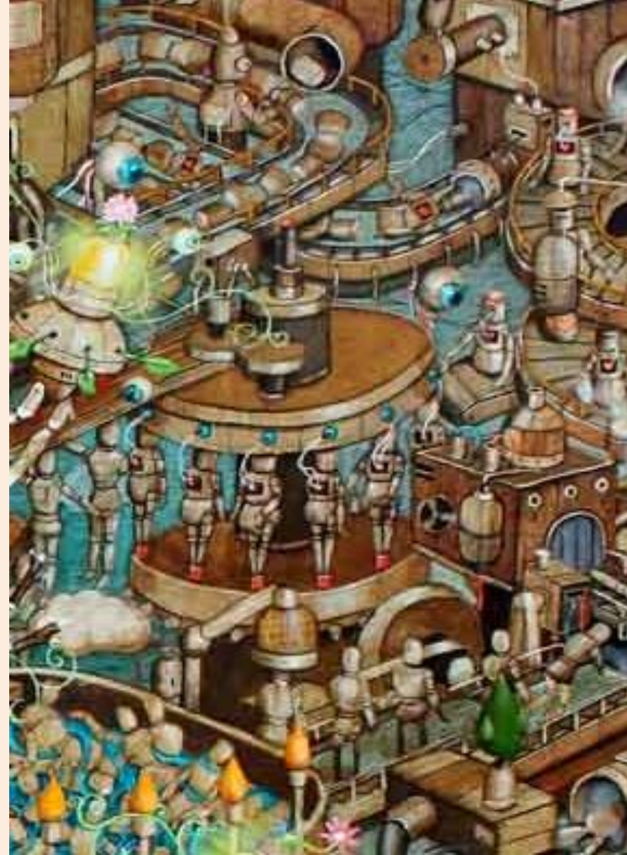
Gatot Indrajati | CONVEYORISM | 2012 | Acrylic on canvas | 200 x 185 cm (Details)