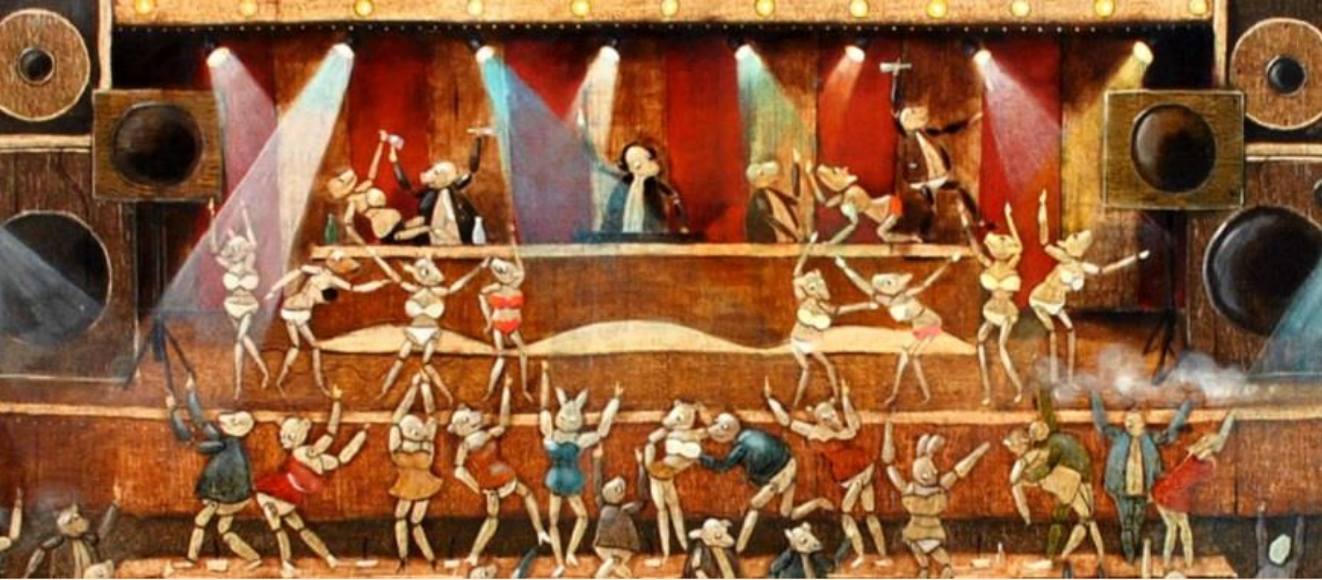
Gatot Indrajati | INTERMEZZO | 2012 | Arcylic on canvas | 170 x 230cm (Detail)