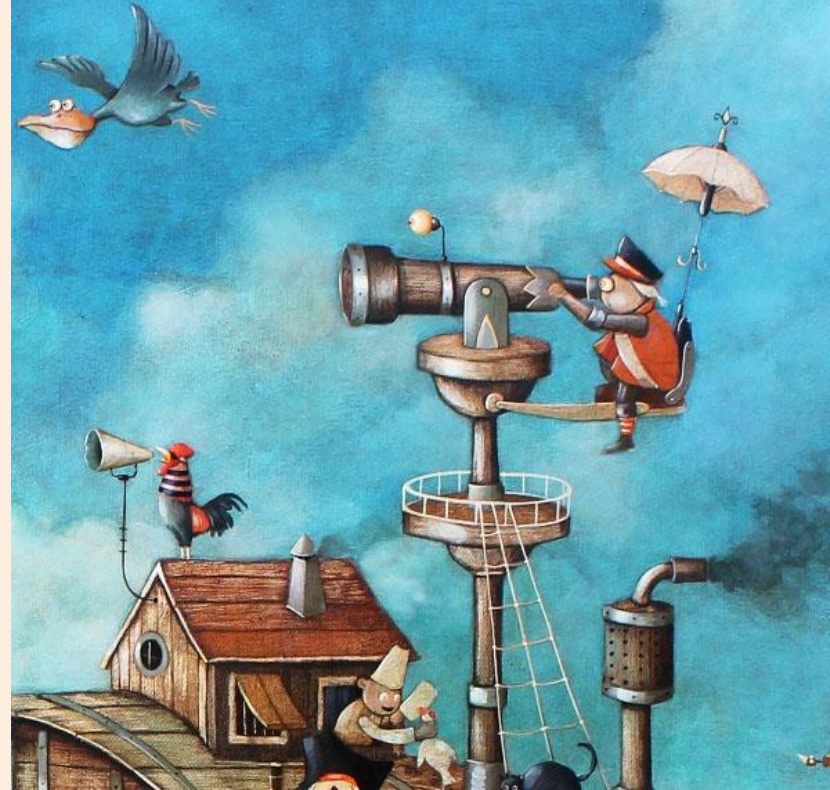
Gatot Indrajati | FISHERMAN FRIEND | 2013 | Arcylic on canvas | 190 x 225cm (Details)