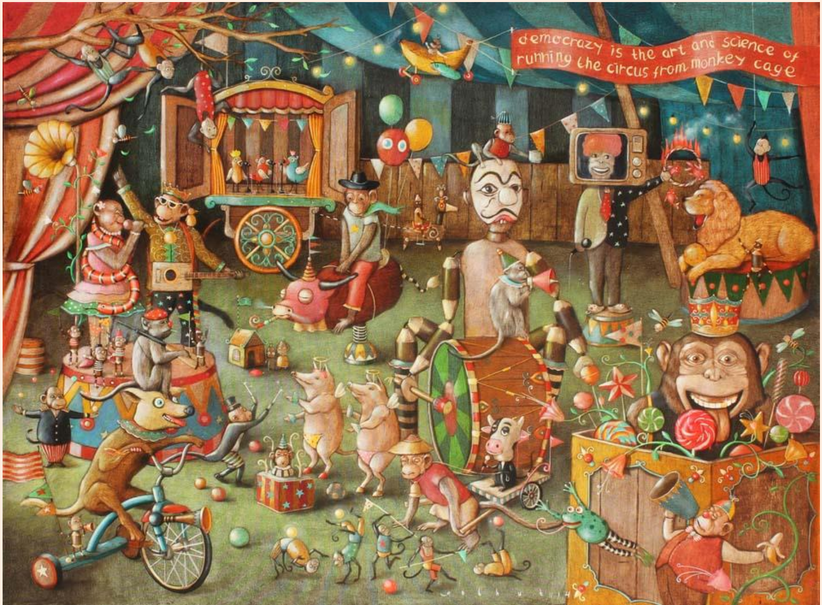
Gatot Indrajati | MONKEY SHOW | 2012 | Arcylic on canvas | 150 x 200cm