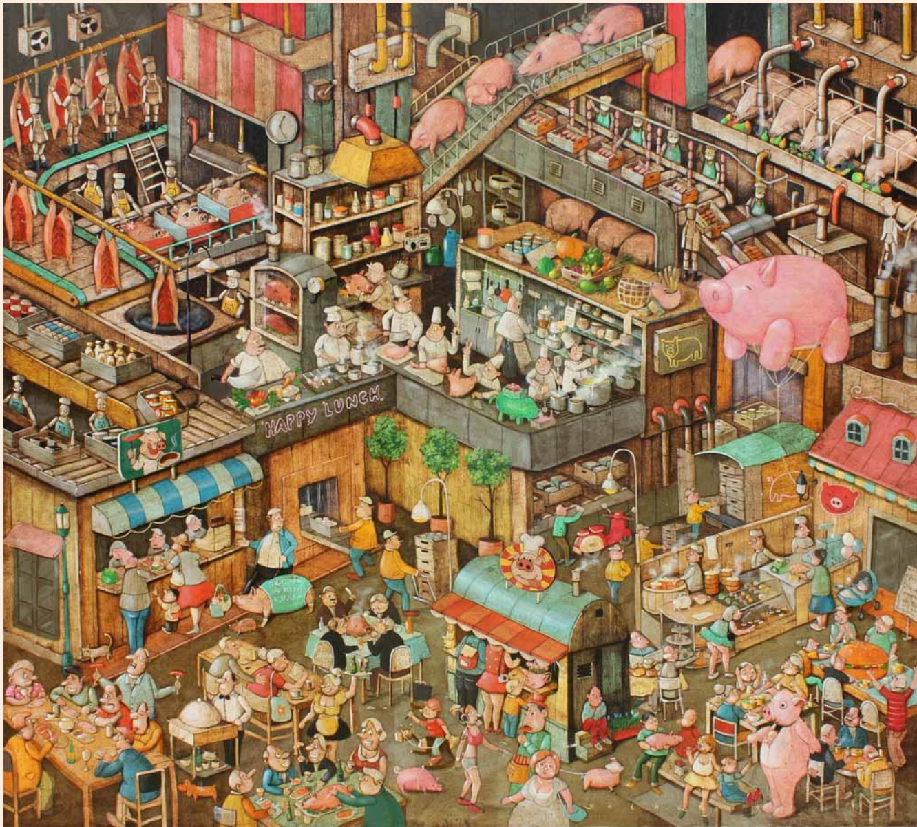
Gatot Indrajati | HAPPY LUNCH | 2014 | Arcylic on canvas | 170 x 190cm