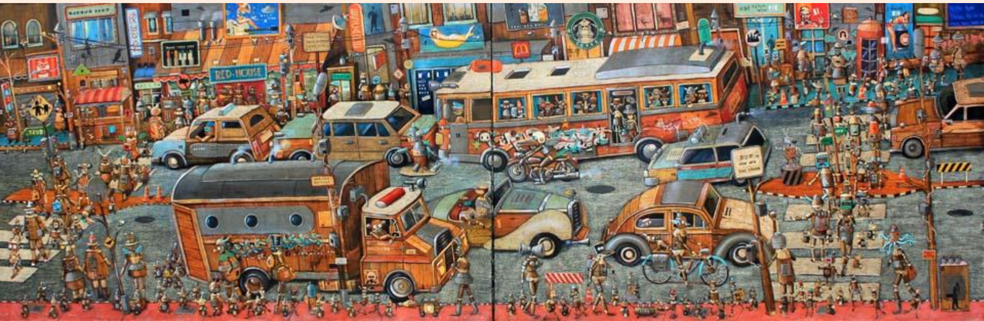
Gatot Indrajati | CULTURE SHOCK | 2012 | Acrylic on canvas | 125 x 400cm (2 Panel)