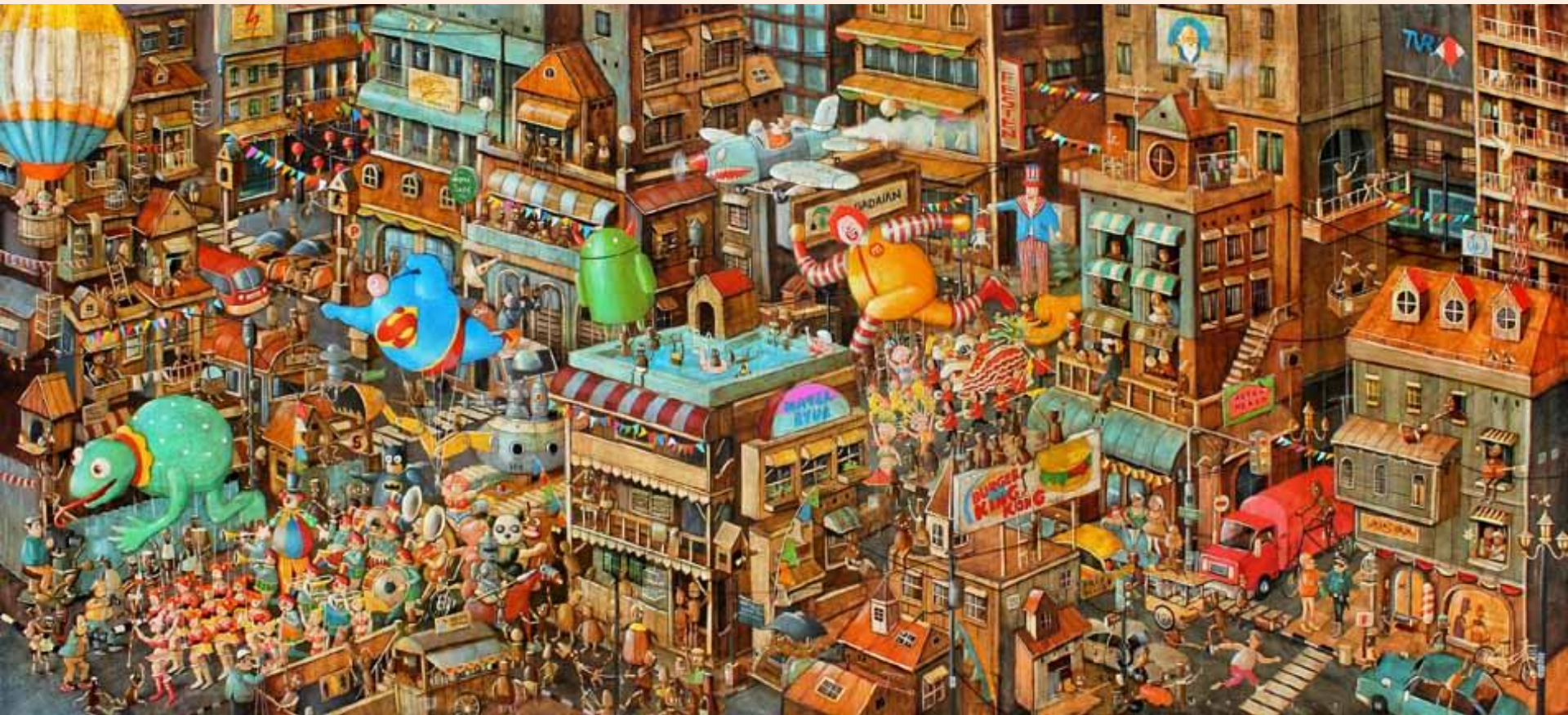
Gatot Indrajati | CARNIVAL | 2013 | Acrylic on canvas | 135 x 300 cm