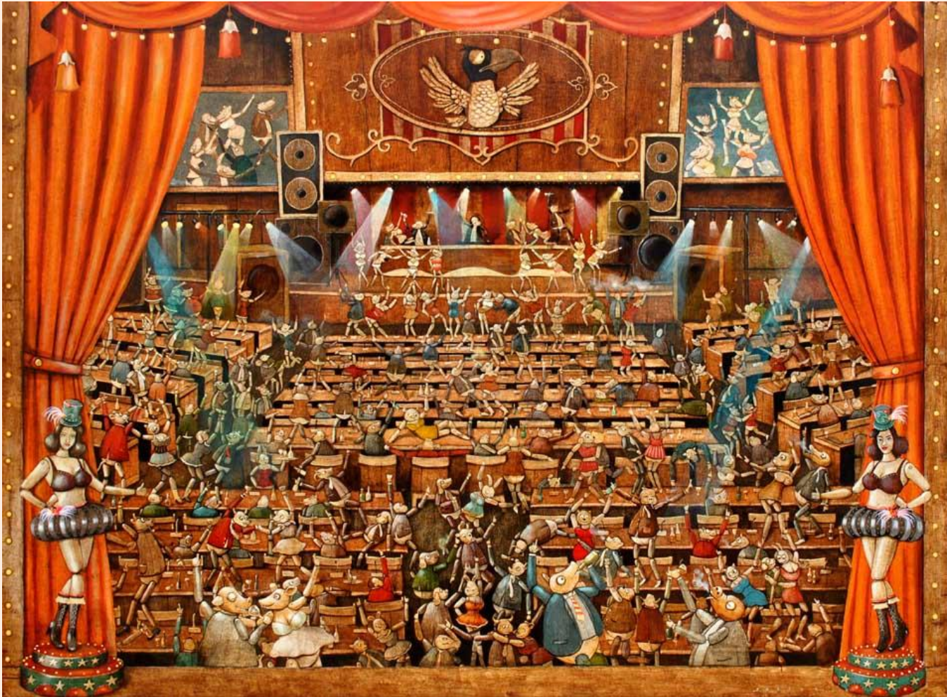
Gatot Indrajati | INTERMEZZO | 2012 | Arcylic on canvas | 170 x 230 cm