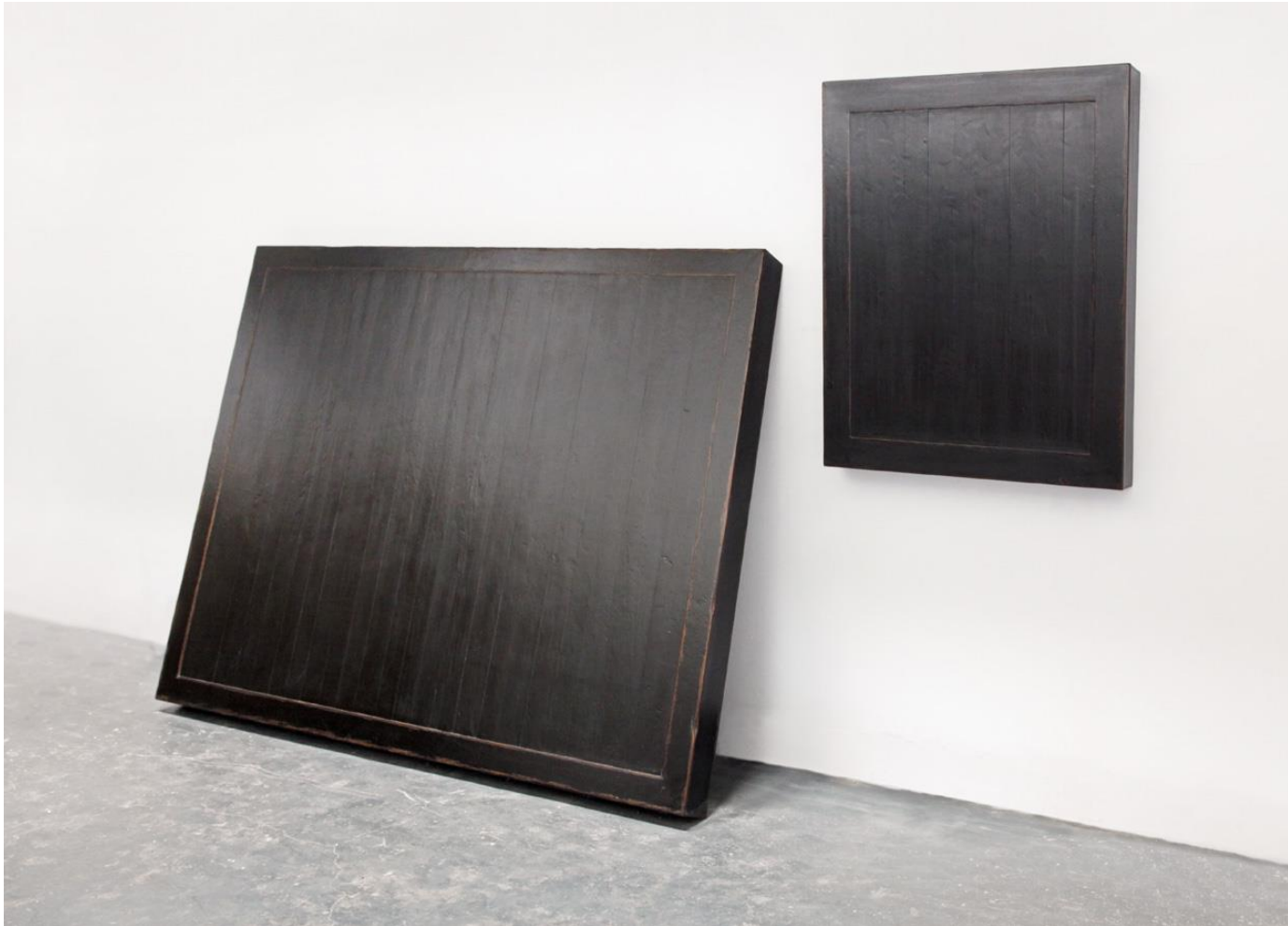
Black Lacquer Landscape Leaning, Black Lacquer Portrait Hanging / 黑漆图景-倾斜，黑漆肖像-悬挂 2008

Songmu timber and synthetic lacquer with pigment