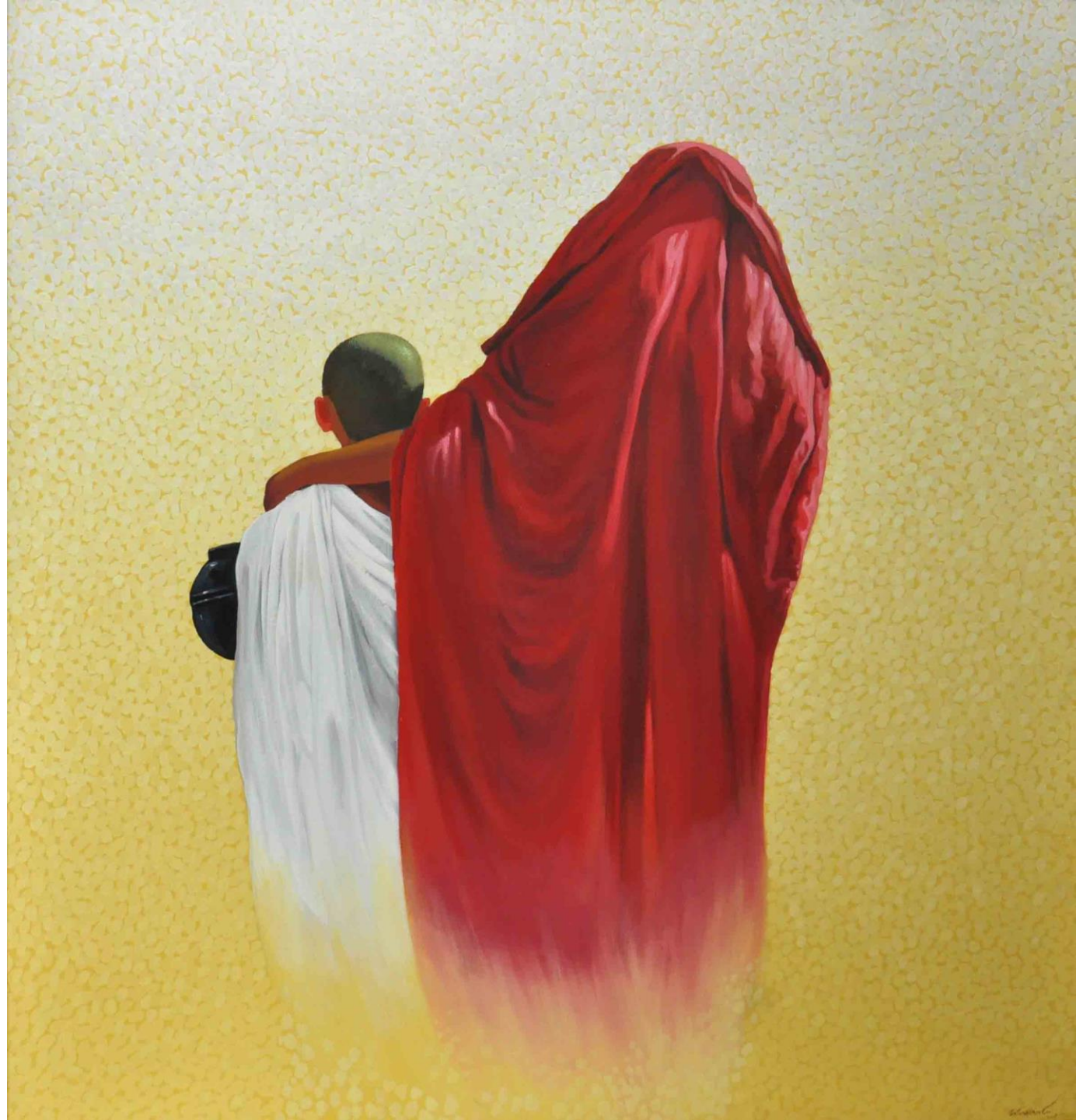
Phoethudaw & Red Monk | 2002 | Acrylic on canvas | 104 x 109cm