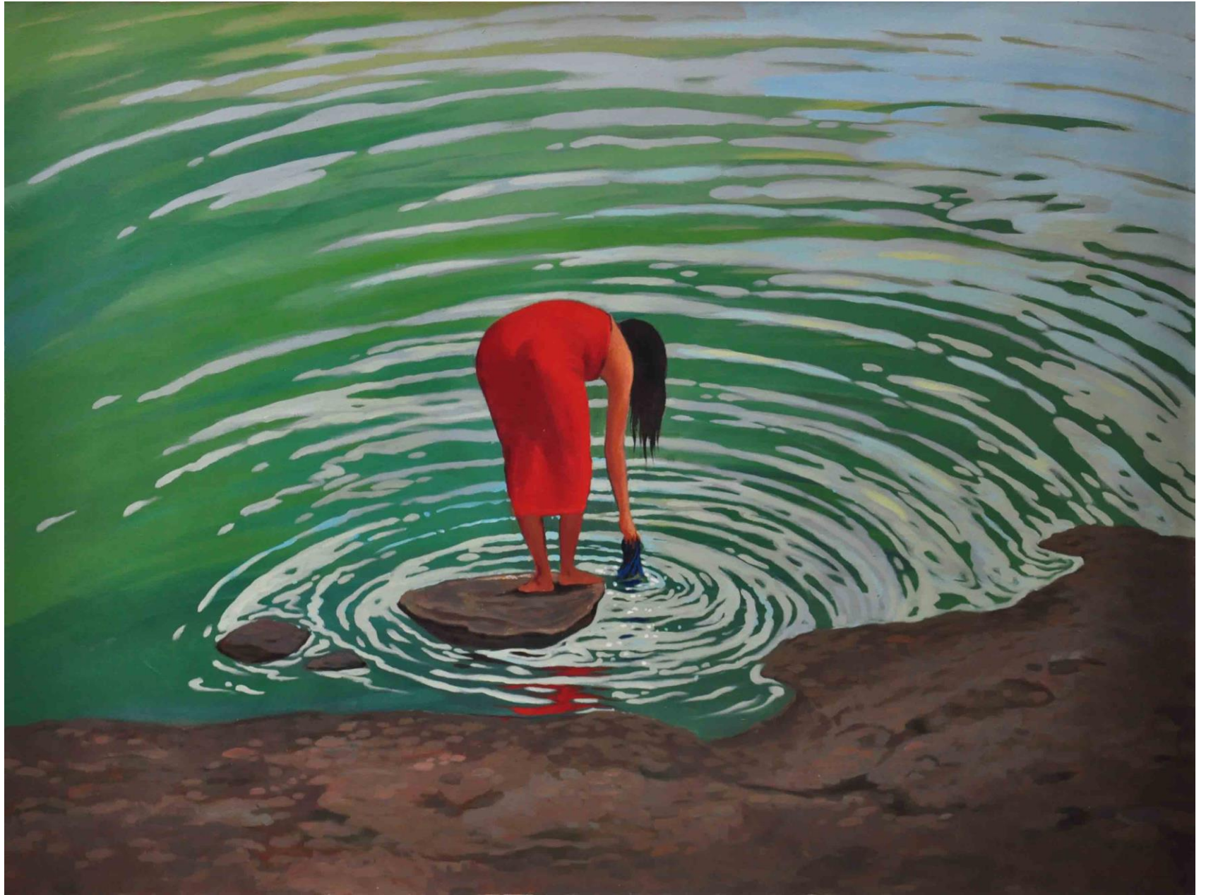
Lady With Red Longi | 2001 | Acrylic on canvas | 90 x 120cm