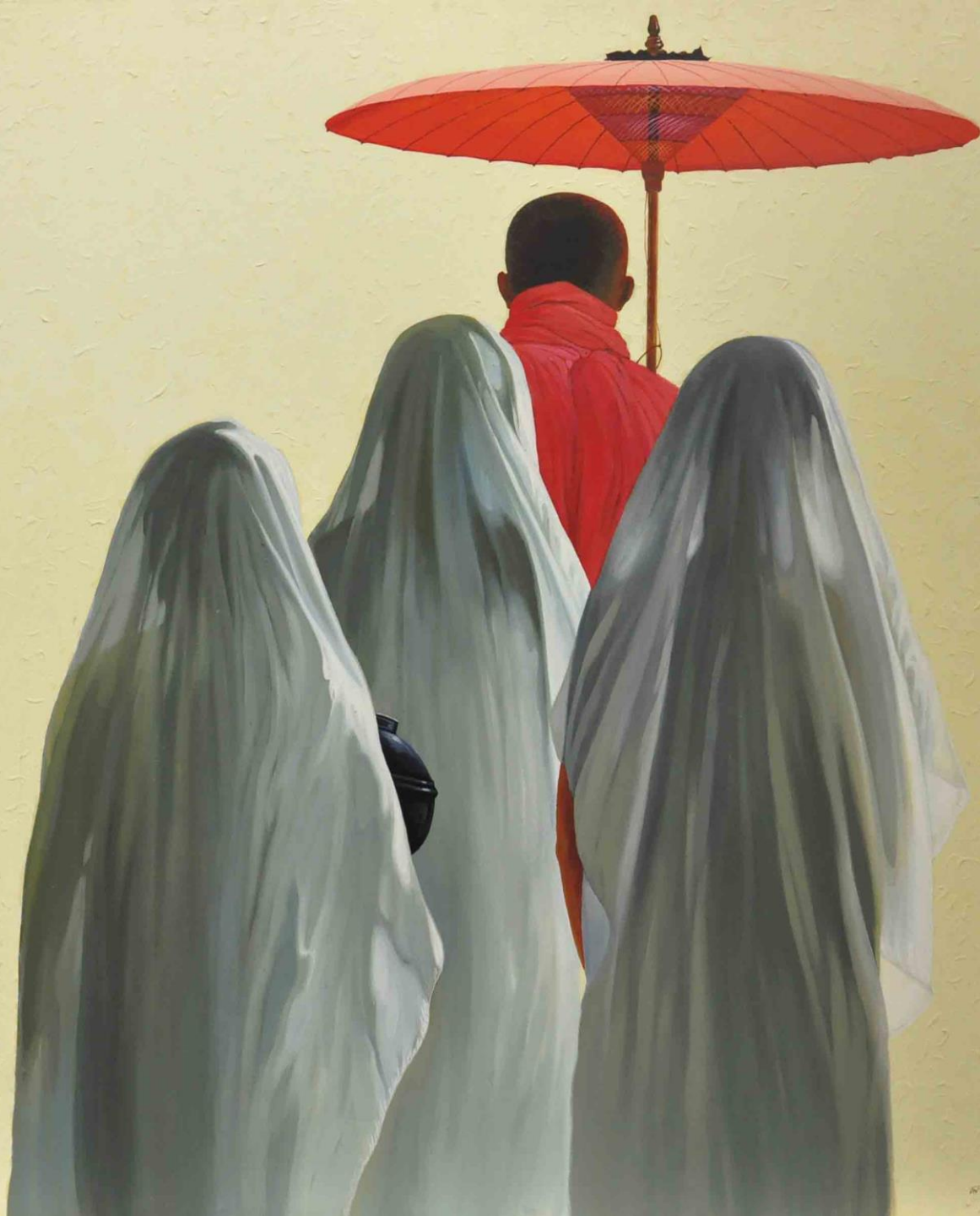
White & Red Monks | 2002 | Acrylic on canvas | 115 x 110cm