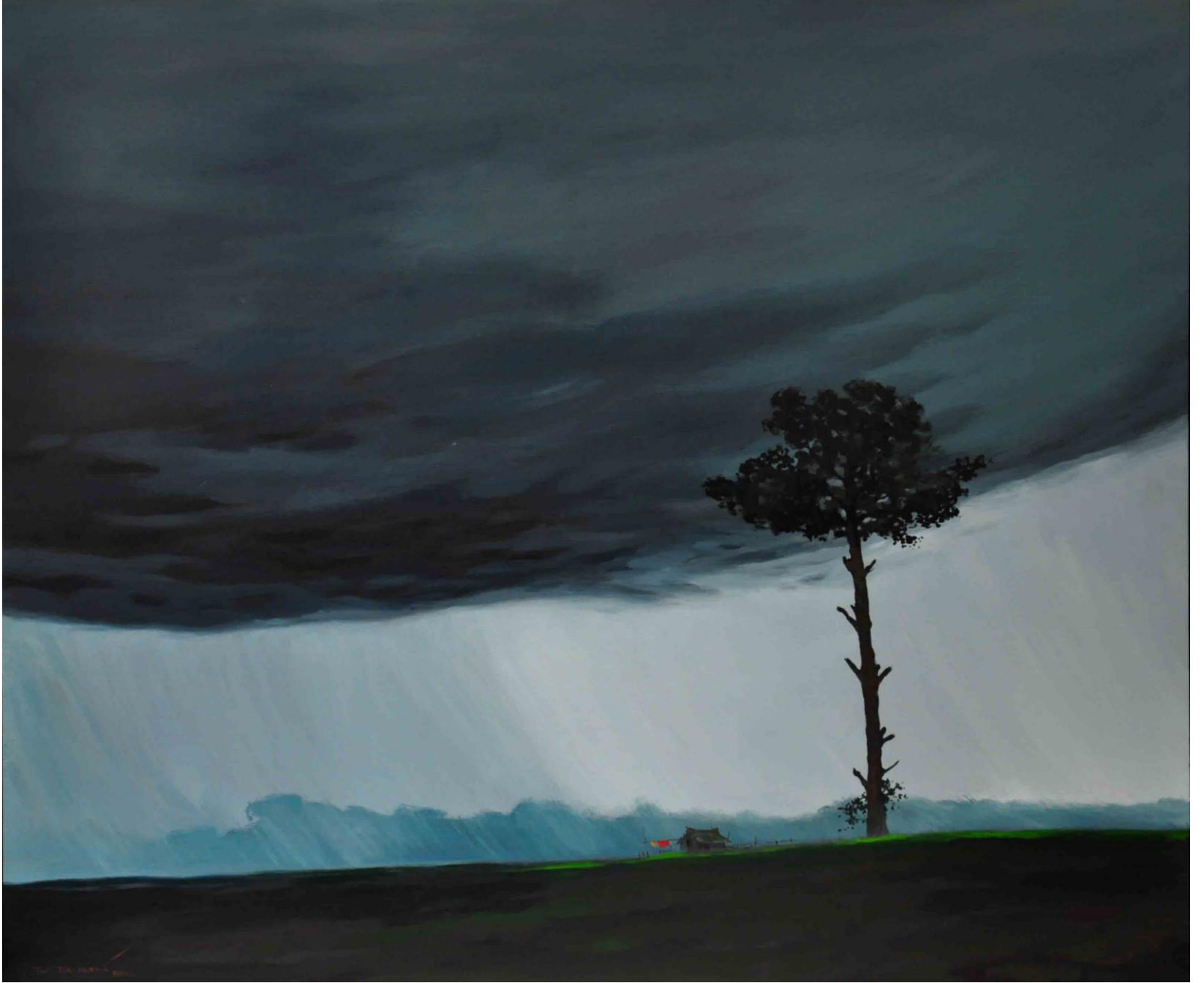
Rainy Day | 2001 | Acrylic on canvas | 84 x 99cm