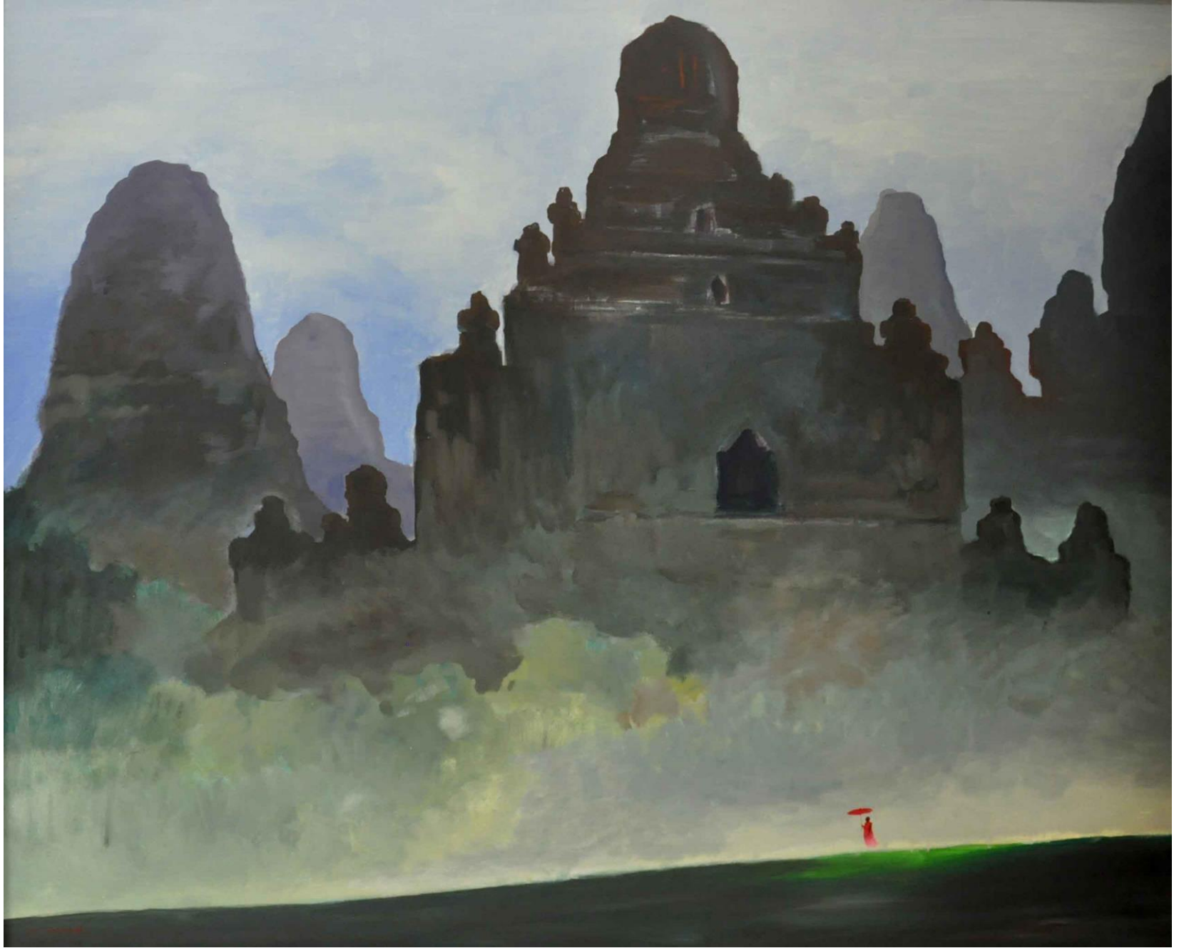
Morning at Bagan | Acrylic on canvas | 107 x 132cm