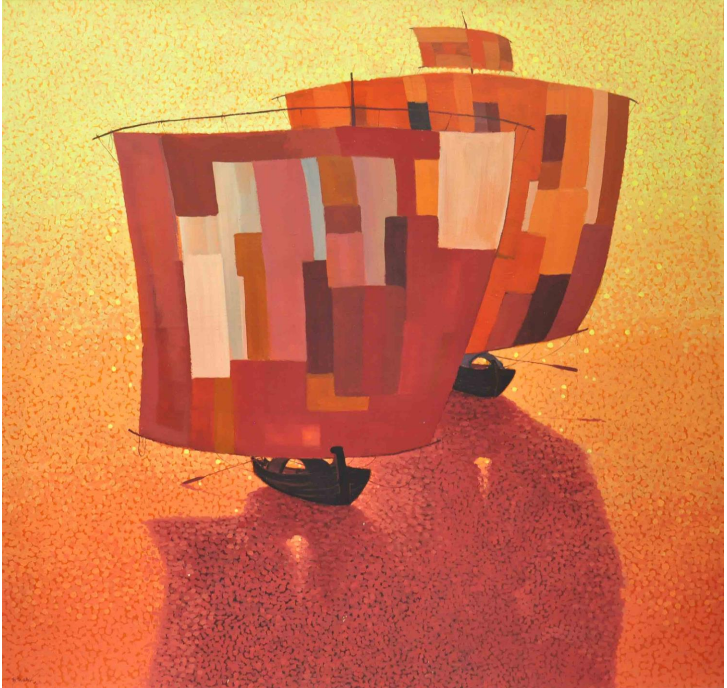
Boats In Sunset | 2002 | Oil on canvas | 103 x 108 cm