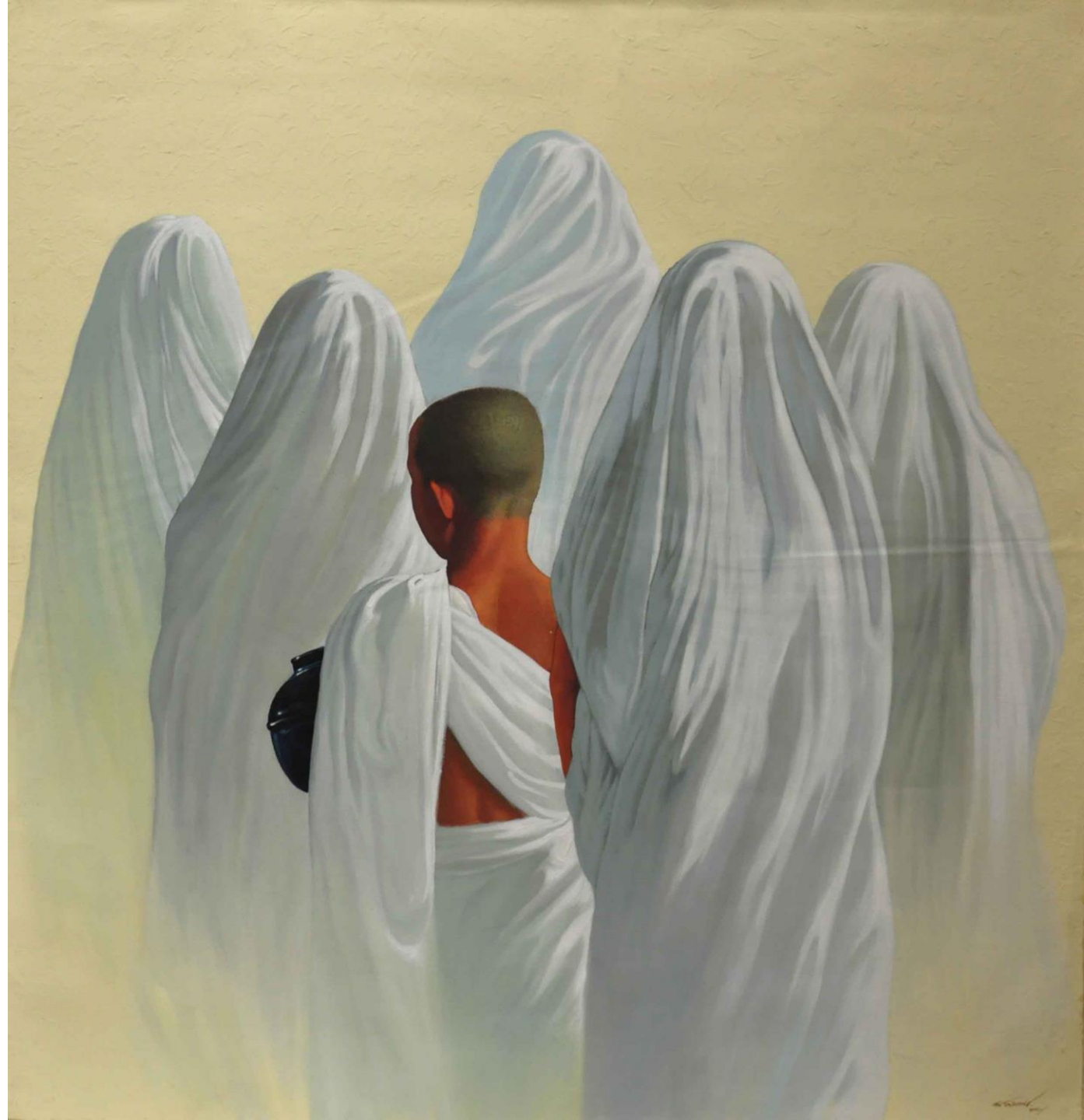
Five White Monks & White Robes | 2002 | Acrylic on canvas | 115 x 110cm