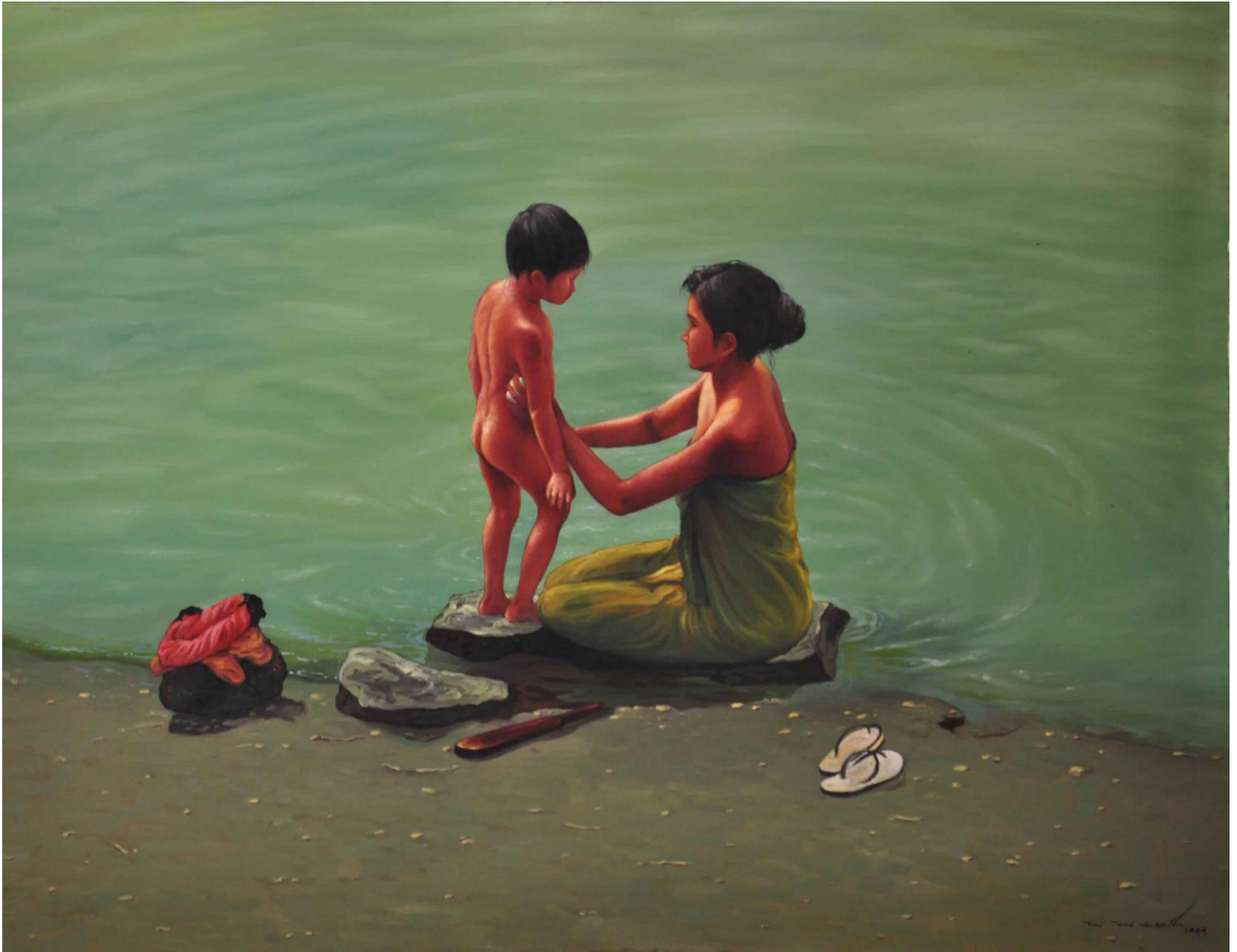
Mother & Child | 1999 | Acrylic on canvas | 78 x 100cm