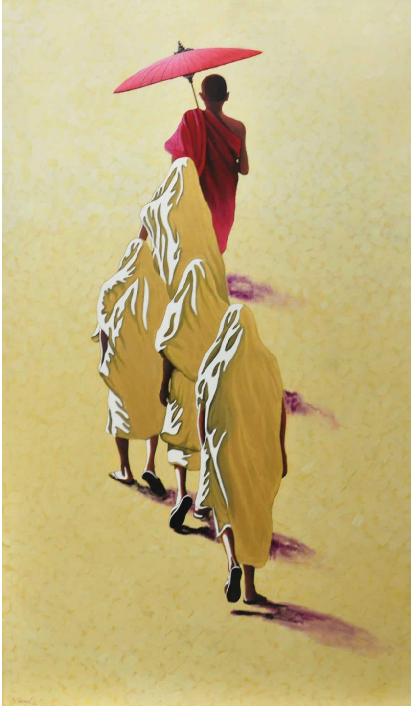
Phoethudaw & Little Novices | 2003 | Acrylic on canvas | 153 x 92cm