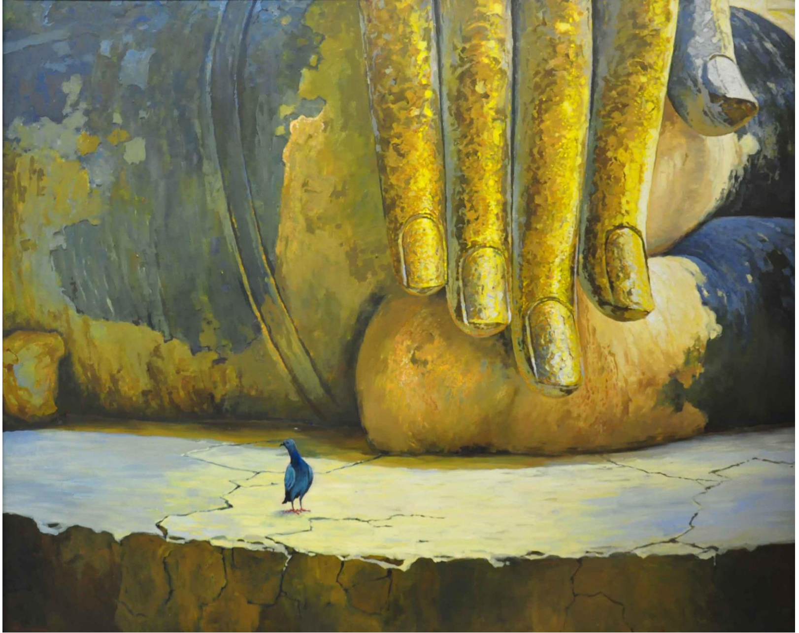
At the Foot of Pagoda | 2000 | Acrylic on canvas | 107 x 132cm